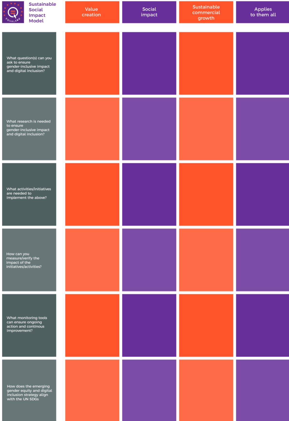
Figure 1: The Sustainable Social Impact Model Worksheet